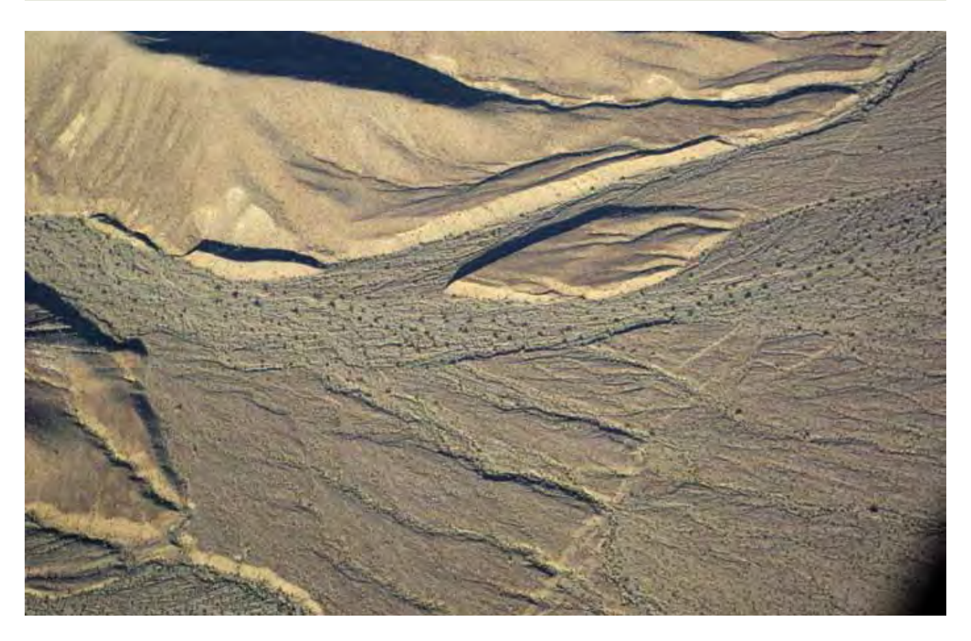
What you can see: Fault scarps across fans and lakebeds, truncated or notched ridges.